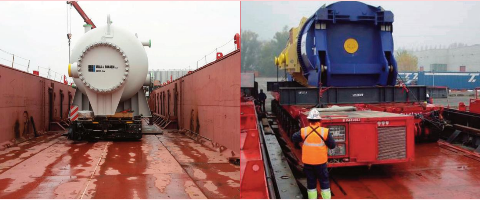
Pictures above: Loading operations of heavy items with the use of the barge Aft lifting platform Picture below: Loading operation of a generator by means of Gantry Lifting system in Cremona river port